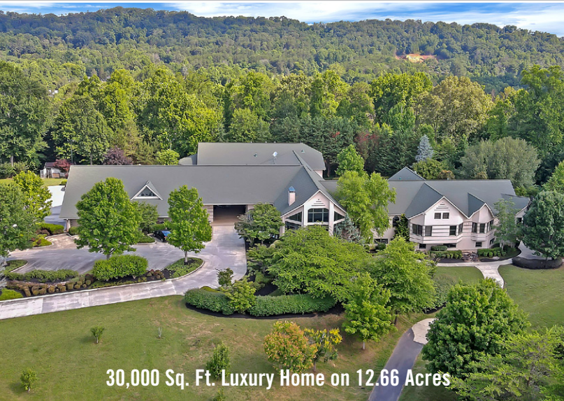
30,000 Sq. Ft. Luxury Home on 12.66 Acres