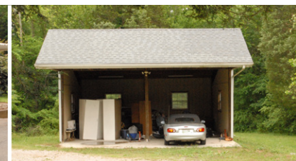
2 Car Garage