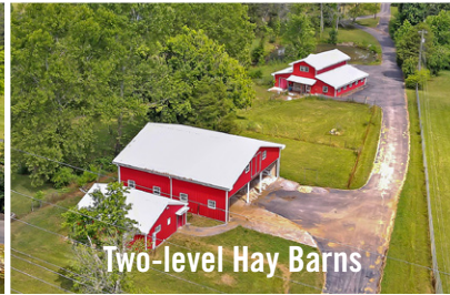
Two-level Hay Barns