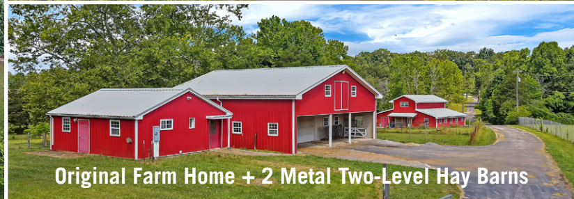
Original Farm Home + 2 Metal Two-Level Hay Barns