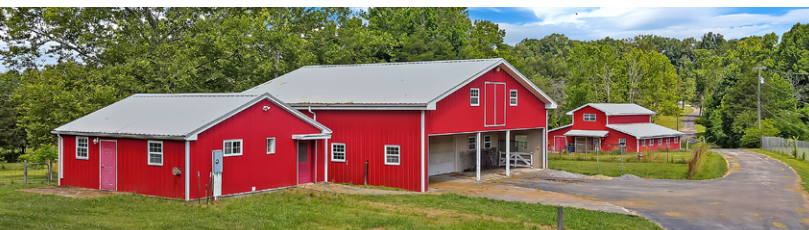
Original farm home (650 Sq. Ft. building) + 2 Metal two-level hay barns with horse stalls, concrete floors, water and restroom