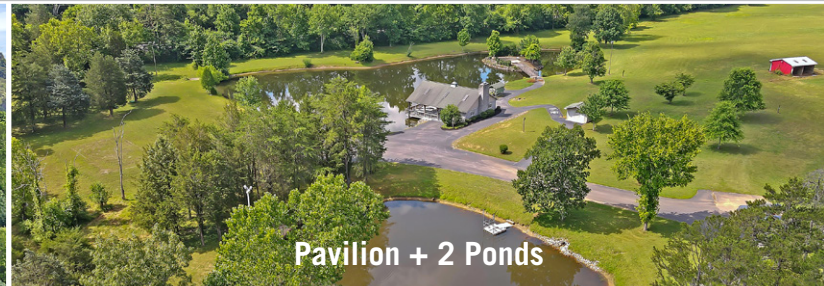
Pavilion + 2 Ponds