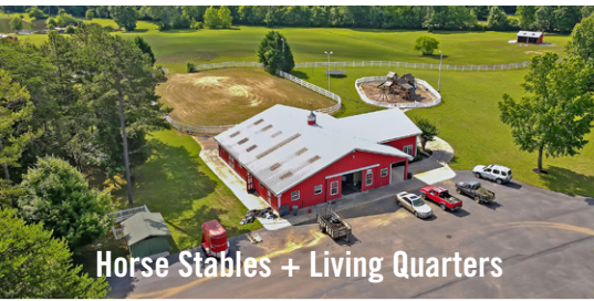
Horse Stables + Living Quarters

• 30,000 Sq. Ft. • 2 Elevators • Fabulous Outside Patio with Waterfall, Ideal for Entertaining • 5 Car Garage + RV Garage